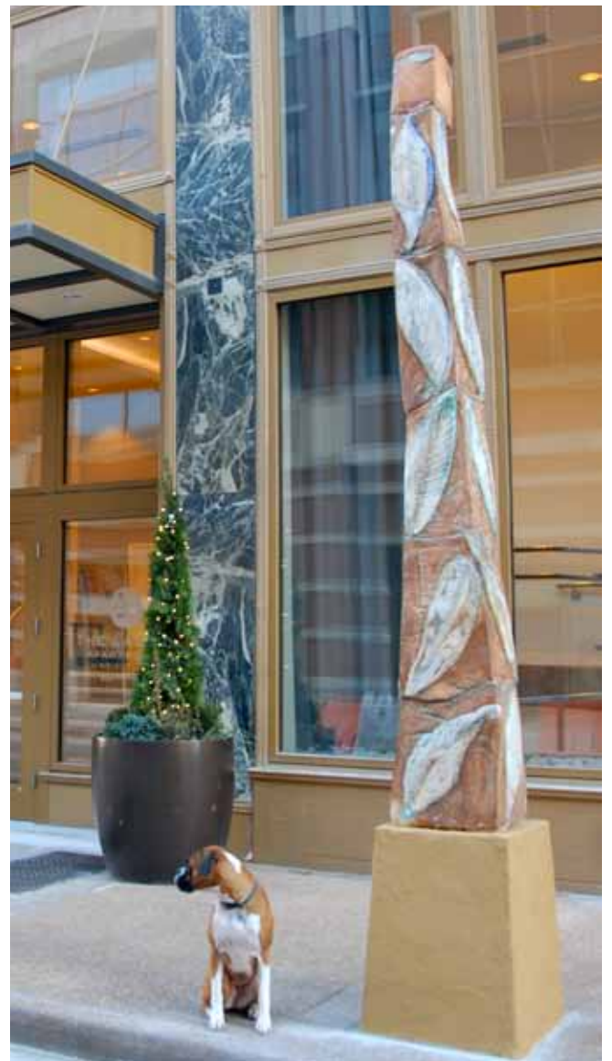
Clockwise from left: Big Tree is also at Novus Internation in Saint Charles, Acorn, boxer Isadora, at city of Oakland, Grant's trail , Laurel Building, Laurel Column, downtown, 7th and Washington Ave.